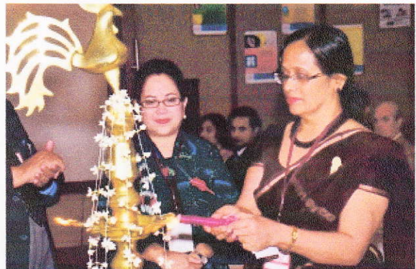
Lighting the Candles as Launch of the Sri Lanka National Program for Prevention of Hearing Impairment 11th Sep 2012