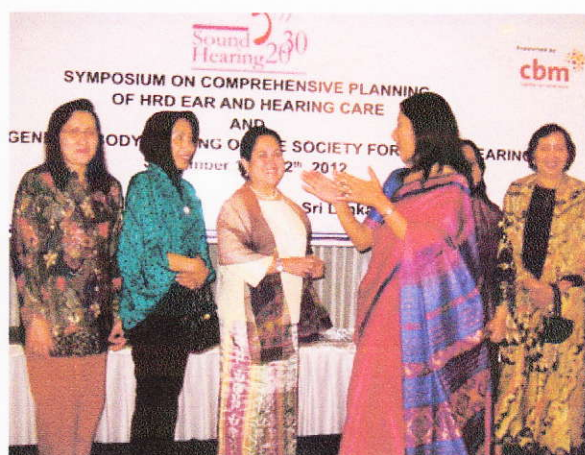
Participants from various countries