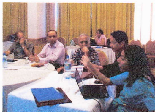
Discussing issues at the Executive Committee Meeting Sept 13th. 2012