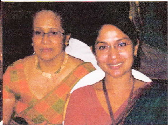
Welcome dinner with amazing cultural performances