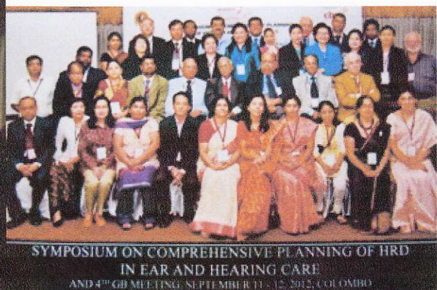
SYMPOSIUM ON COMPREHENSIVE PLANNING OF HRD IN EAR AND HEARING CARE AND 4 TH GB MEETING, SEPTEMBER 11-12, 2012, COLOMBO